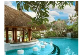
Grand Mirage Hotel, Bali, Indonesia